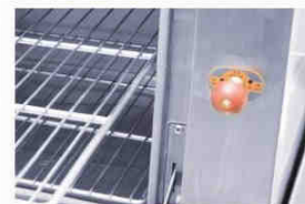
3. Equipped with steam On/Off valve - for energy-saving purpose