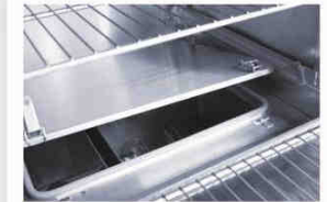
9. Accessible boiler for cleaning