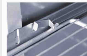
5. Latch system to protect the shelving from falling