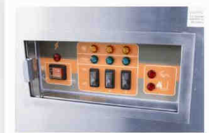
10. Splash proof switches