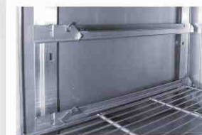
7. Adjustable rail for shelving