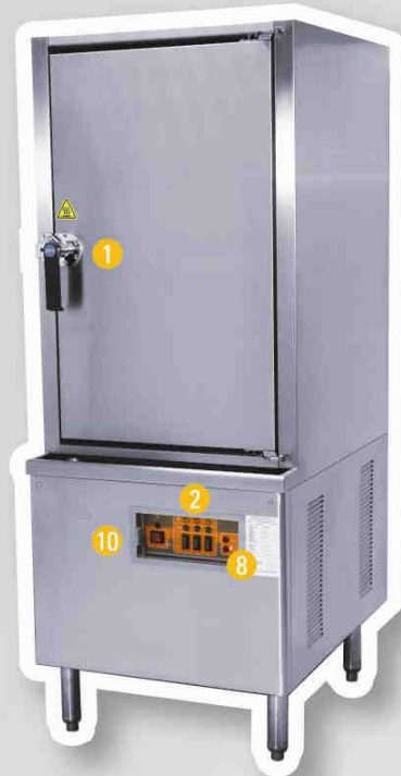
MC-25KN / MC-25RN - Single Door (8 Shelvings)

Leego Chinese Electric Steam Cabinet is the environmental friendly equipment with silent operation and no emission. Superior quality heating elements are used for all Leego product range. With the insulation, the thermal efficiency can be utilized up to 90% which significantly saves time and costs. Single deck and triple deck models are available.