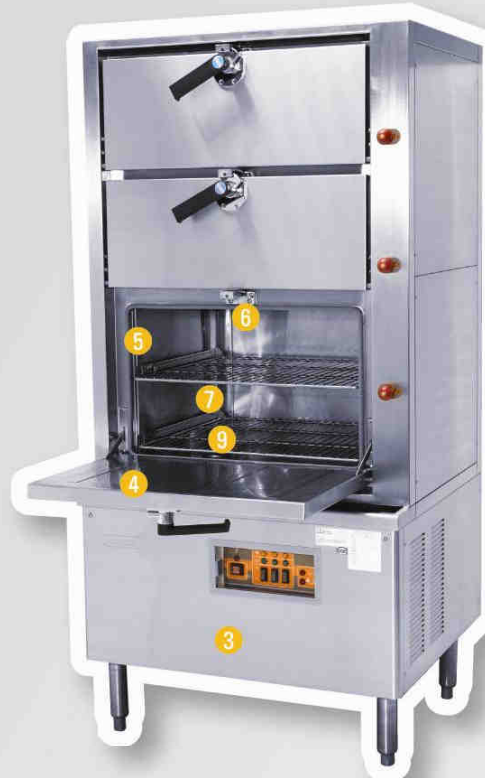
MC-26K / MC-26R - Triple Doors (4 Shelvings)