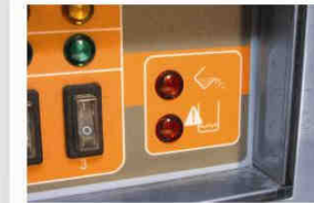
8. Auto-drainage system to avoid limescale