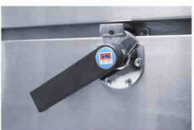
1. 2 steps rotary lock for secure shut