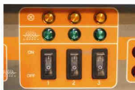
2. Power level selector (3 levels)