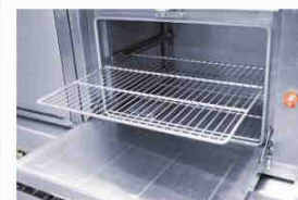
4. Pull out shelving design