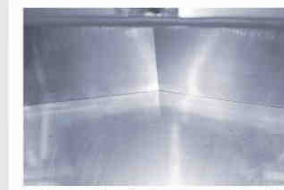
6. Slanted top design in each deck to prevent condense dripping